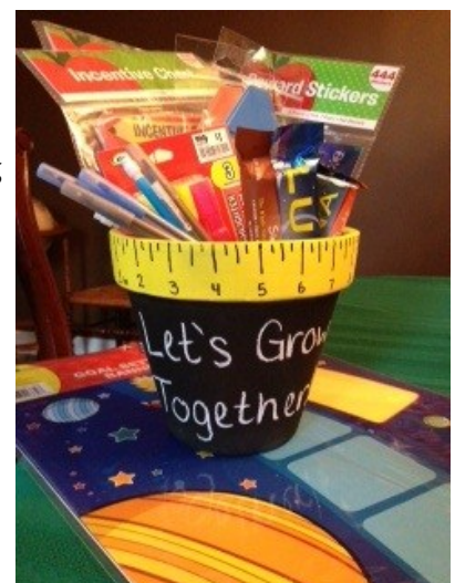
PHOTO: Gifts to the new teachers

Thanks to all members who gave to the cause.