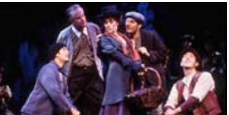
“My Fair Lady” Tuesday, November 01, 2011 at 7:30 pm