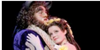
“Beauty and the Beast” Tuesday, November 29, 2011 at 7:00 pm