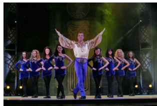
“Michael Flatley’s Lord of the Dance”

at the Vern Riffe Center for Performing Arts in Portsmouth, Ohio