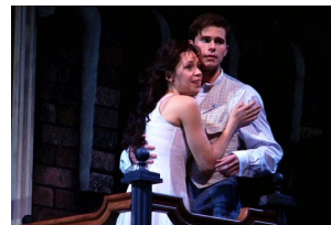
“Romeo and Juliet”