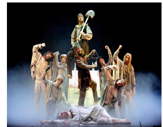
“Monty Python’s Spamalot”